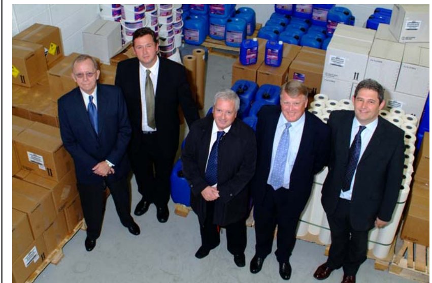
The Directors of FarmCare GB and Biolink after their meeting.